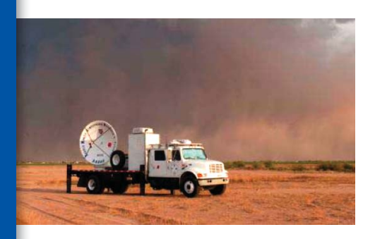
To get more complete data, NSSL scientists collaborated to build mobile Doppler radars capable of scanning and penetrating an entire storm from a close-in location.

Data from the Dimmitt, TX tornado intercept during VORTEX helped scientists answer some questions about how tornadoes form, but raised important new ones.